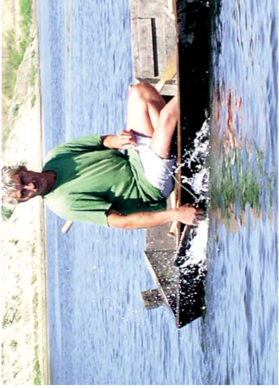
Tradicionalni način ribolova soma «bučka» Traditional fishery technique for the wels, the “bučka”