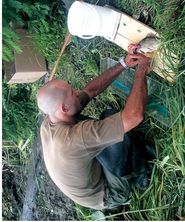
Intiološka istraživanja rukavca «Tišina» u Čigoću Ichthyologic investigation of the Tišina oxbow, Čigoć