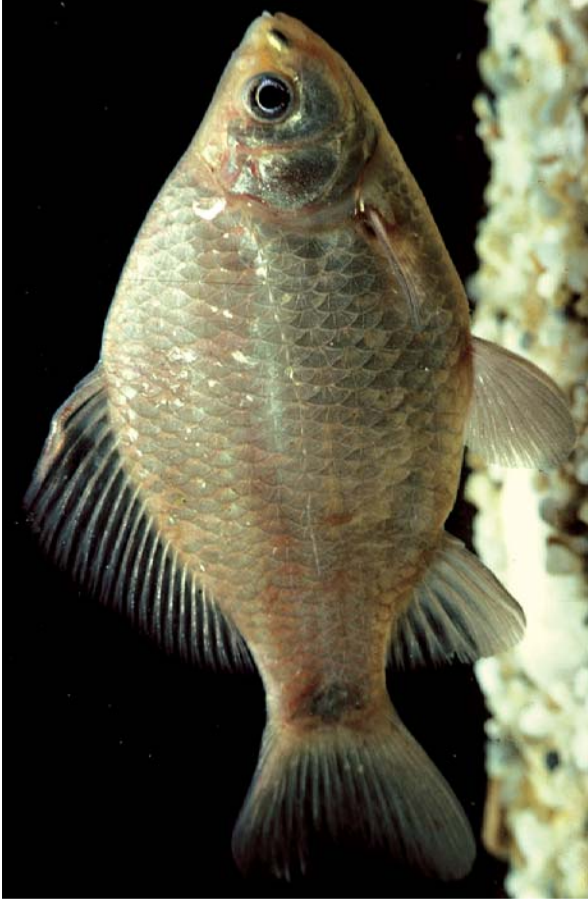
Carassius carassius / Karaš / Crucian carp