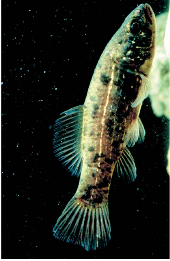
Umbra krameri / Cmka / European mud minnow