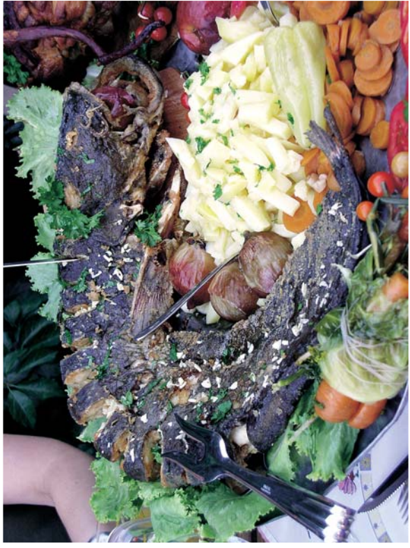
1. Som u lokalnoj gastronomskoj ponudi Wels in the local restaurant trade