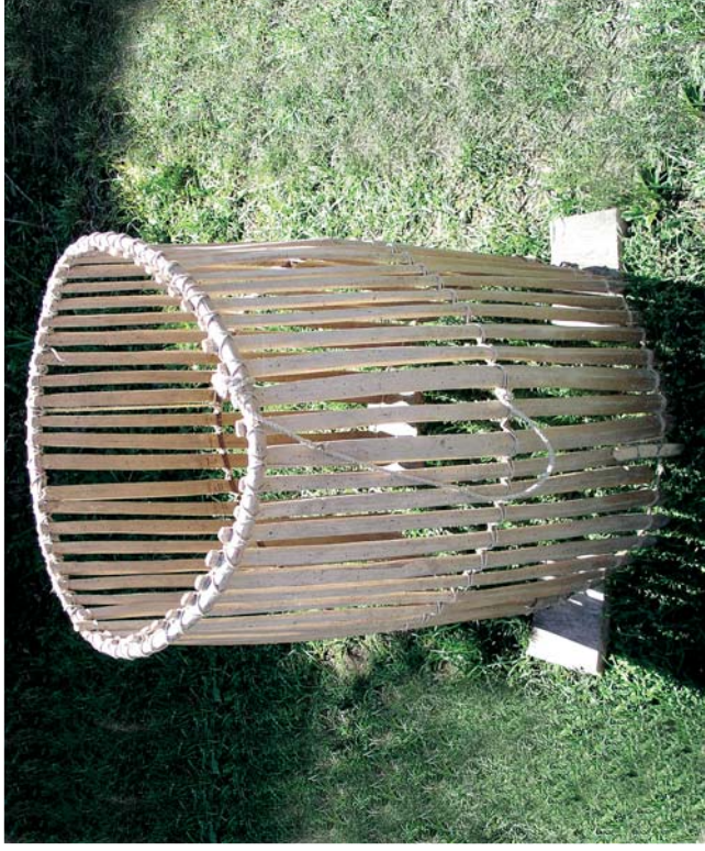
Tradicionalni ribarski alat: koš / Traditional fishery device: basket