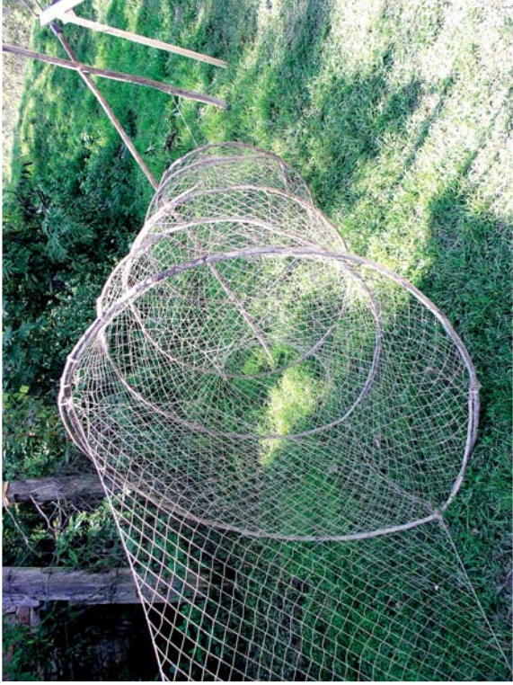
Tradicionalni ribarski alat: vrška / Traditional fishery tool: fish pot