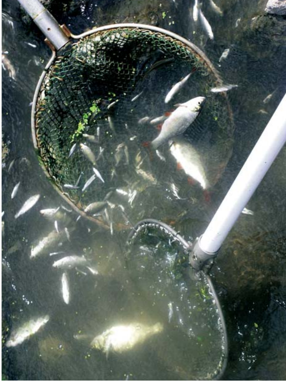
1. Istraživanje riba na ustavi Trebež Ichthyologic research into the fish population at Trebež Weir